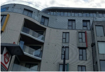
Colliers Wood Library