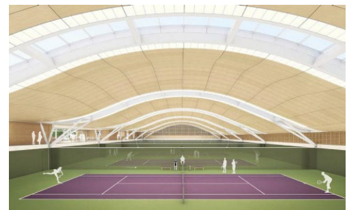
AELTC Covered Courts